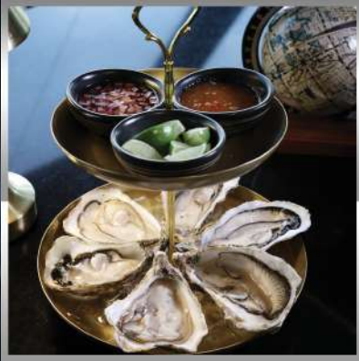
OYSTER | SHALLOT VINEGAR SPICY SEAFOOD SAUCE LIME WEDGES (3)THB 360 (6)THB 620