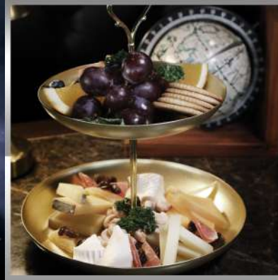
CHEESE PLATTER | DRIED FRUIT OLIVE | HONEY | BREAD (3)THB 550 (5)THB 850