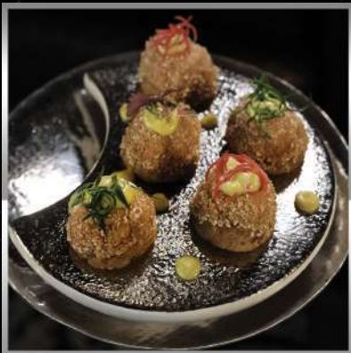
MERCURY BALL FRIED SHRIMP BALLS GINGER LIME AIOLI THB 300