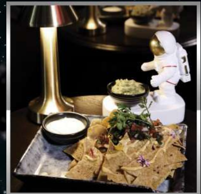
CHEESY NACHOS GUACAMOLE | SOUR CREAM TOMATO SALSA (V) THB 360

ALL PRICES ARE SUBJECT TO 10% SERVICE CHARGE AND 7% VAT