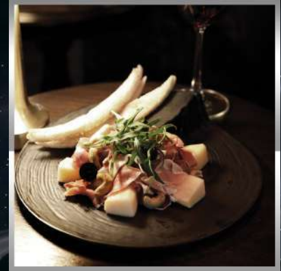
PARMA HAM (100 G.) CANTALOUPE | OLIVE CRISPY BREAD | CASHEW NUT THB 520