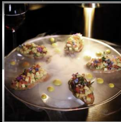
BRUSCHETTA | AVOCADO MANGO | FRESH TOMATO BASIL | COTTAGE CHEESE (V) THB 280